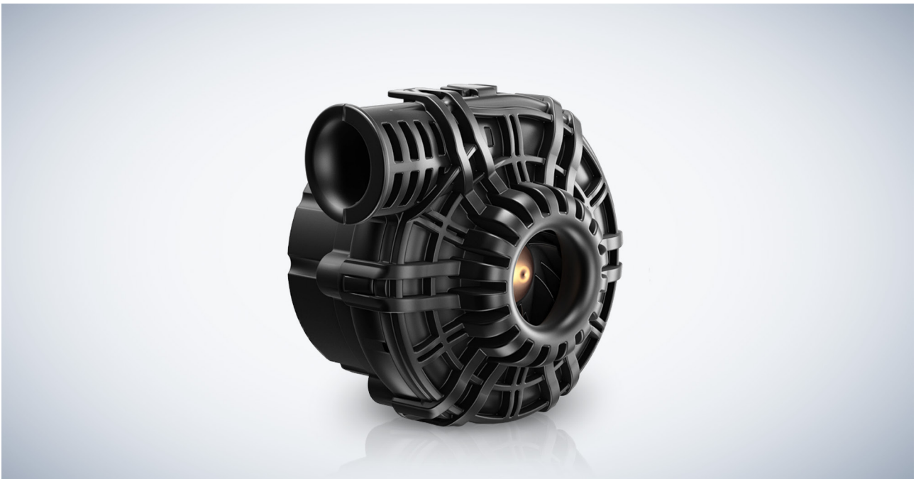
Fig. 1: The RV45 offers highly available, efficient and quiet air delivery (actual size).

The reliability of medical devices and their components is particularly important. Particularly when using apnea machines at home or as a ventilator in the intensive care unit, simple operation is also important. If, for example, a ventilator is used during sleep, such a device must be located close to the user and must not interfere with healthy sleep due to operating noises. In order to meet these requirements, the fan and drive specialist ebm-papst from St. Georgen in the Black Forest developed the RV45 radial fan for ventilators and similar dynamic applications that meets these requirements - safe, reliable, efficient and quiet (Fig. 1).